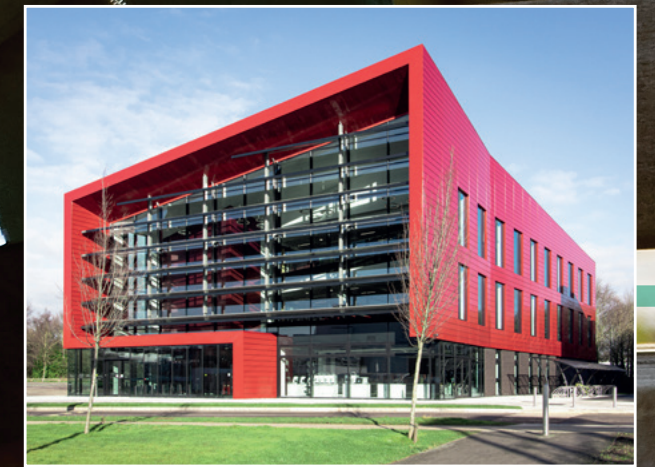
WMG Degree Apprenticeship Centre

We're developing a dedicated Degree Apprenticeship Complex on campus and opened our first Degree Apprenticeship Centre for apprentices studying manufacturing and engineering in September 2019. This innovative space provides an exciting learning environment for apprentices with open spaces for collaborative and individual work, technology-enabled seminar rooms and a purpose-built laboratory.