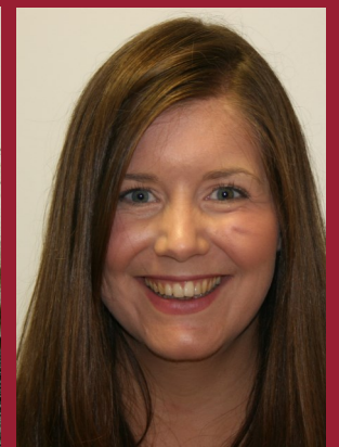
Miss Cotter Geography NQT