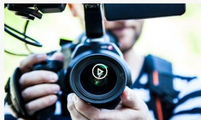
Media, Journalism & Publishing